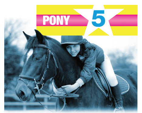
Further your knowledge, your ability and your enjoyment of your sport.

Coaches will need to see you demonstrate the criteria, question your understanding and you should have completed answers to the questions for the star level in which you are studying.